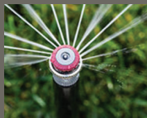
MP Rotator Flow (GPM) = 0.17 to 1.01

Example: A 73% reduction in GPM used was achieved by removing traditional spray heads ( 1.85 \times 20 \text{ min} = 37 \text{ gal} ) and retrofitting them with MP Rotator heads ( 0.50 \times 20 \text{ min} = 10 \text{ gal} ).