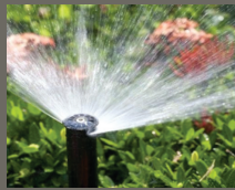
Traditional Spray Head Flow (GPM) = 0.1 to 5.52