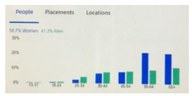
Backflow Assembly Testing by Age and Gender

Video Promotion - Irrigation Retrofit and Backflow Assembly Testing. At the May meeting discussion included purchasing airtime to promote both of the videos. Tonilee Hanson contacted Blue Sky Marketing and received quotes for media campaigns valued at $3,000 and $8,000. Video ads are more expensive than digital ads and the recommended length for videos is 15 to 30 seconds. Both of the IWAC videos are over one-minute in length and are not easily edited to the shorter lengths. The $3,000 campaign would fund approximately 90,000 impressions over one month for one video. The $8,000 proposal would promote one video and run for two months. It would include 60,000 targeted video display ads and 44,000 OTT video ads. OTT ads are delivered to streaming services. Dan Kegley pointed out that people have the option with OTT to skip the ads so impressions would not necessarily be views. Discussion followed. The consensus was that a traditional display ad campaign might be more effective by connecting viewers to the Irrigation and Landscape Design page that has videos, webinars and the Irrigation Design Standards guidebook.